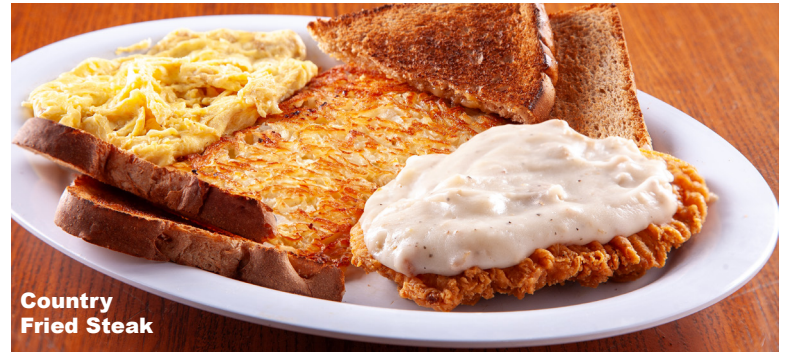
Country Fried Steak

All Steak & Egg meals served with two eggs cooked to order, hash browns or home fries, and your choice of toast or buttermilk biscuit. Add a short stack for $4.00.